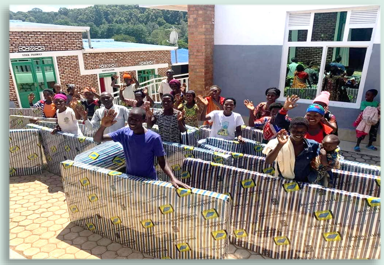
Sponsored Children Receiving Mattresses