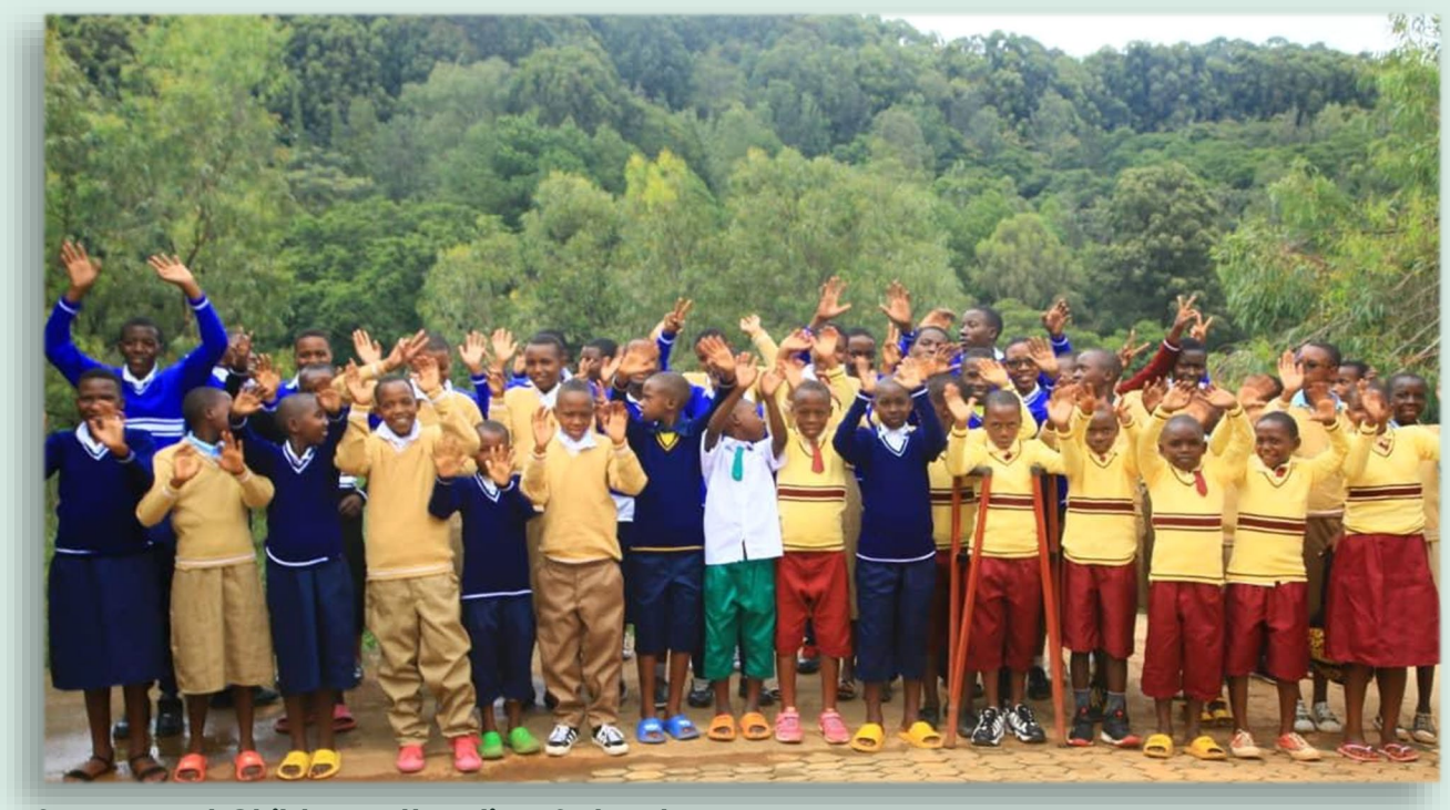
Sponsored Children Attending School