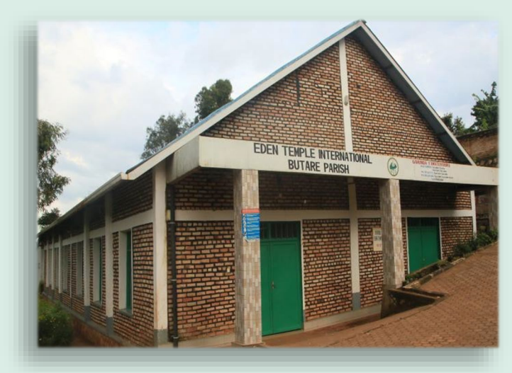
Mukoni (Butare) Parish