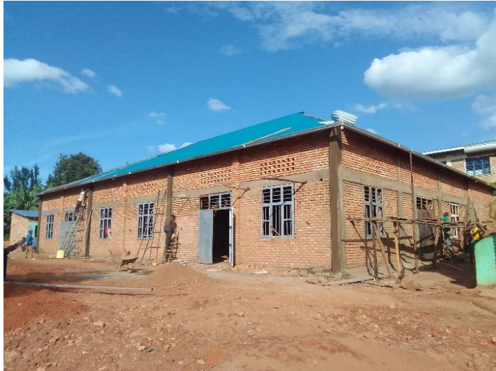
VUMBI PARISH KARAMA PARISH