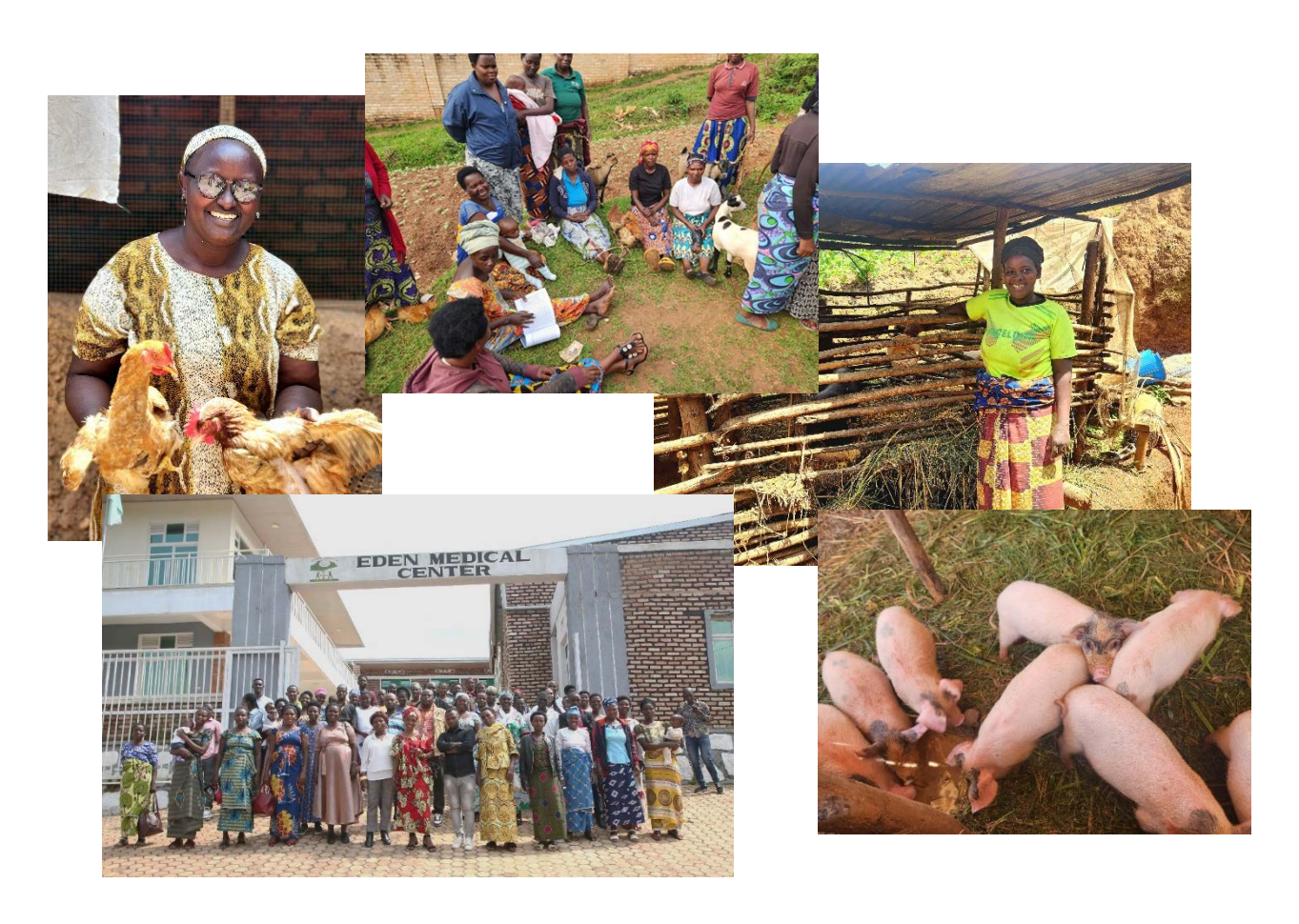
Empowerment Training in Self-Help Groups

Eden's Child self-help groups play a vital role in shaping and transforming the lives of sponsored families. Parents actively participate in group meetings, pooling their savings to create impactful changes in their households. These savings are invested in livestock and farming, providing both sustenance and income through surplus harvest sales. Currently, the groups collectively own 2 sheep, 1 cow, 205 chickens, 236 pigs, 58 rabbits, and 234 goats, which not only support agriculture but also provide manure to enrich farming. The initiative empowers families to address financial challenges, fostering resilience and self-reliance. Leaders of the self-help groups have undergone specialized training on leadership skills, equipping them to inspire and guide their members effectively. These trainings emphasize fostering development within the groups and creating sustainable progress. With 999 dedicated members from all groups, the program thrives as mothers work tirelessly to achieve independence. This collective effort not only ensures food security but also drives economic and social transformation within the community. Currently their saving is 7,608,143Rwf